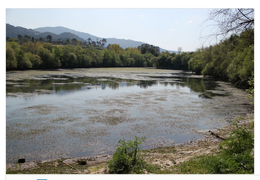
Figure 4. doi

A photograph showing the view of the study area (Lenta Marina) in the Minho Estuary. The image shows the semi-enclosed bay, characterised by the presence of near-shore vegetation and the calm water surface where the fish sampling took place.