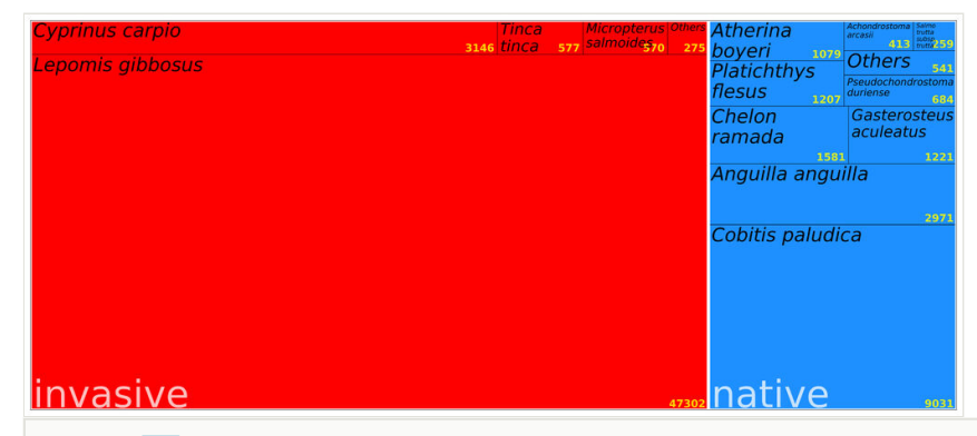
Figure 5. doi

A photograph showing the view of the study area (Lenta Marina) in the Minho Estuary. The image shows the semi-enclosed bay, characterised by the presence of near-shore vegetation and the calm water surface where the fish sampling took place.