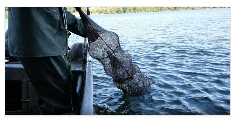
Figure 2. doi A photograph showing the removal of a fyke net from the water in the Minho Estuary.

and a central wing of 3.5 m were used to collect the fish (Fig. 2). These nets were consistently set in the morning and left submerged for 5.5 \pm 2.6 days (average \pm SD) (Fig. 3). To ensure even spatial coverage, the fyke nets were always set parallel to the shore and distributed close to the bay mouth at fixed locations (Fig. 1). Although the number of fyke nets used per sampling date varied due to technical issues (e.g. lost or damaged fyke nets), up to five fyke nets were employed per sampling date. After retrieving of the fyke nets, all captured individuals were identified (following Froese and Pauly (2023) and Martins and Carneiro (2018)) and counted (Fig. 5). During the entire study period, a total of 3,029 samples (i.e. individual fyke nets) were collected.