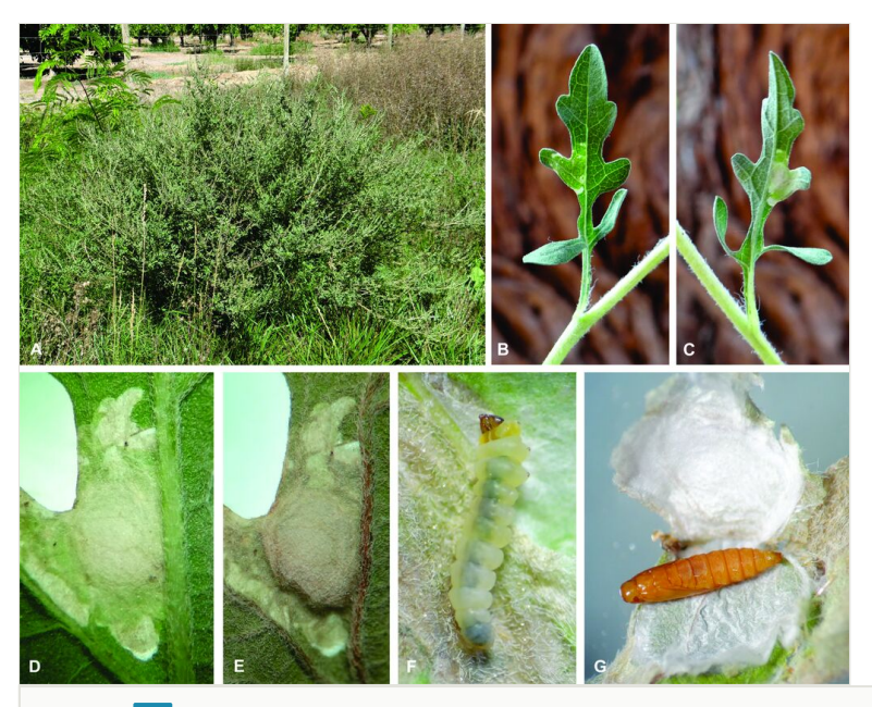
Figure 3. doi

abaxial surface of the leaf and the larva penetrates the leaf through this side. New mines are visible only from the abaxial surface of the leaf, while completely developed mines are partially translucent and, thus, detectable from the two leaf sides, suggesting that the larva eats a great part of the internal tissues of the leaf. The last instar constructs a well-delimited circular cell (nidus) inside the mine for pupation. Adult emergence occurs through a slit on the margin of the nidus (Fig. 3).