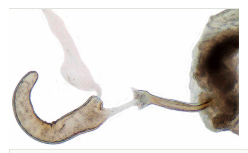
Figure 3. Female genitalia, spermatheca.