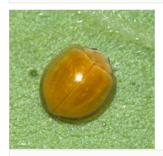
Figure 4. Live specimen of Micraspis pusillus sp. n.