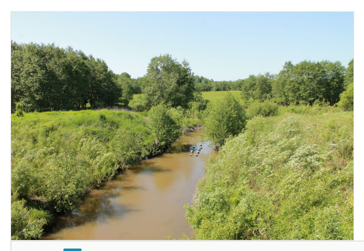
Figure 2. doi Habitat of M. griseola – Bobrovka River.

All of our finds of M. griseola were made in small rivers with different depths, flow rates and soil patterns; in three of the four rivers, higher aquatic vegetation was absent at the sampling site (Fig. 2). The studied rivers are located in the flat eastern part of the Sverdlovsk Region. The Rivers Bobrovka, Kirga and Borovaya are tributaries of the Tura River, the Urga River is a tributary of the Pyshma River. All rivers belong to the Ob-Irtysh Basin.