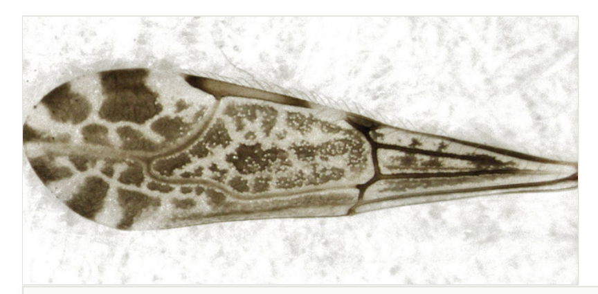
Figure 1. Emesopsis infenestra (forewing)