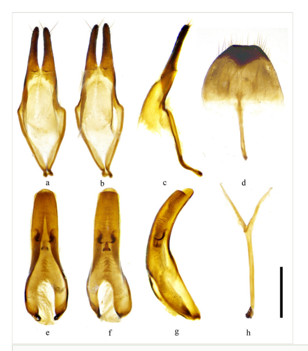
Figure 2. doi Male terminalia of Uraecha nigromaculata sp. n. a-c parameres; d tergite VIII and sternites VIII; e-g median lobe; h spiculum gastrale. (a, d, e, h ventral view; b, f dorsal view; c, g lateral view). Scale bar 0.5 mm.