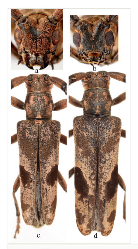
Figure 3. doi Habitus of Uraecha angusta (Pascoe, 1856). a, c male; b, d female; a, b head, front view; c, d dorsal view. Not to scale.

then gradually tapering to apex, with sparse, mostly short setae and only several long setae in U. nigromaculata sp. n. (Fig. 2a–c). In contrast, the lateral lobe gradually constricts from base to apex, with dense short and long setae at about apical 1/2 in U. angusta (Fig. 4a–c); (2) The basal half of median lobe is relatively broad in U. nigromaculata sp. n. (Fig. 2e–g), while it is narrow in U. angusta (Fig. 4e–g); (3) tergite VIII is less arcuated with a subtrapezoidal shape and the apex of the spiculum relictum is not widened in U. nigromaculata sp. n. (Fig. 2d), while tergite VIII is rounded and the apex of the spiculum relictum is widened in U. angusta (Fig. 4d).