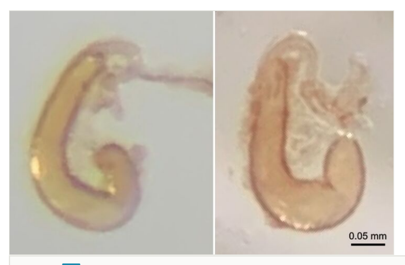
Figure 4. doi

Spermatheca. Receptacle 0.29 mm long, J-shaped, fairly uniform in width, slightly thinner towards the top; pump indistinct from receptacle; duct uniform in width and U-shaped where it is attached at the top of the receptacle, ca. <sup>1</sup>/<sub>4</sub> the width of the receptacle, then becoming thinner, entire duct ca. <sup>3</sup>/<sub>4</sub> the length of the receptacle, a bulbous attachment at the terminus of the U-shaped section at the point at which the duct becomes thinner. There is some intraspecific variability visible between the two spermathecae that we dissected (Fig. 4): the spermatheca of the paratype is terminally more slender and curved in the holotype than in the paratype.