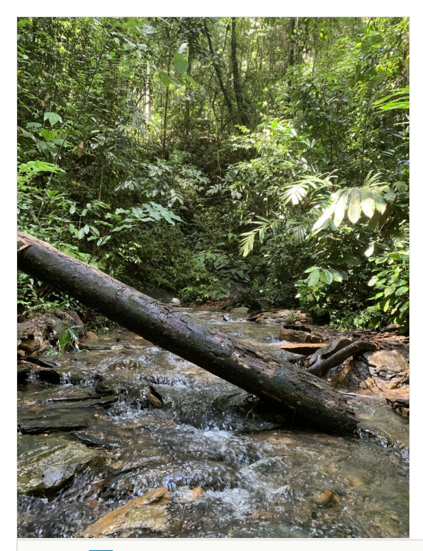
Figure 1. doi

embedding medium (Lompe 1986). Measurements of body parts were calibrated with an image of a ruler taken at the same magnification as the specimen.