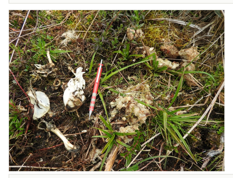
Figure 2. doi

Records for Nasuella olivacea in Ecuador. Red star: this record (3,862 m a.s.l.); Orange circle: Previous highest altitudinal report with a supporting document for Ecuador (3,357 m a.s.l.) (Ramírez 2011); Blue circles: Other records reported for Ecuador (2,300; 2,500 and 2,800 m a.s.l.) (Brito and Ojala-Barbour 2016)