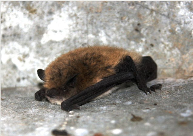
Figure 1. doi David's myotis from Yenisei river.

The base of the hair is dark, the tip is light, the wing membranes and ears are dark Fig. 1.