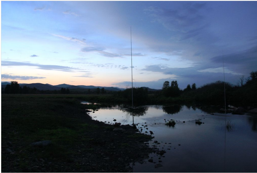
Figure 7. doi

We captured 2 adult males of M. davidii on the Bol'shoj Kizil river (Fig. 7), which is 150 km north of the previously known find. Myotis mystacinus were captured in the same locality. Thus, these cryptic species occur in sympatry.