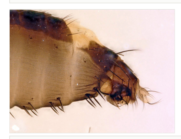
Figure 3. doi Megaselia simunorum new species, male, abdomen lateral.

Figure 2. doi Megaselia simunorum new species, male abdomen, dorsal.