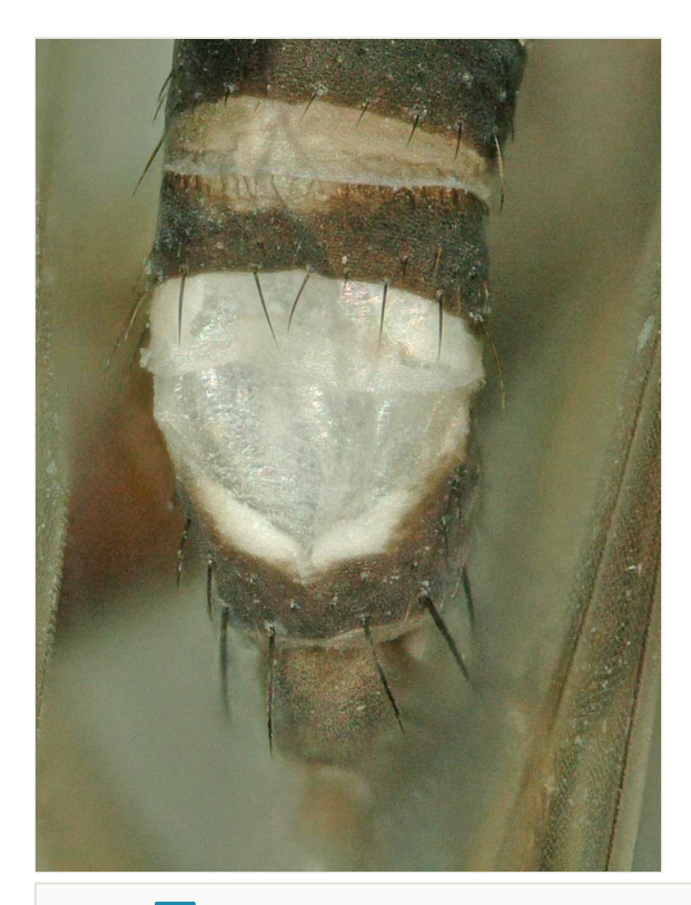
Figure 2. doi Megaselia simunorum new species, male abdomen, dorsal.