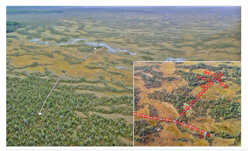
Figure 1. doi General view of the Mukhrino Fields Station infrastructure and position of subplots for observation of macromycetes located along the walking board (in the insert).

Study extent: The long-term monitoring plots were located along a walking board of the research polygon of Mukhrino Field Station (Fig. 1), thereby eliminating any future impacts to the bog as a result of ongoing research programmes. A total of 263 circular x 5 m² (for a total area of 1,315 m²) long-term monitoring subplots were established in May 2014. This total area is nearly evenly divided between the two major plant communities (two "virtual plots"): Pine-dwarfshrubs- Sphagnum dominated bogs (dominated by Pinus sylvestris , Chamaedaphne calyculata , Ledum palustre , Rubus chamaemorus , Sphagnum fuscum ) and Graminoid- Sphagnum lawns (dominated by Scheuchzeria palustris , Carex limosa , Eriophorum russeolum , Oxycoccus palustris , Sphagnum balticum ) and incorporates plant community variation. An area of about 700 m² is sufficiently large to reveal the fungal community diversity in raised bogs, based on species accumulation curves constructed from these data.