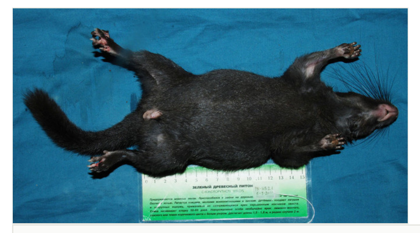
Figure 2. Ventral view of the body of a Laotian Rock Rat Laonastes aenigmamus .