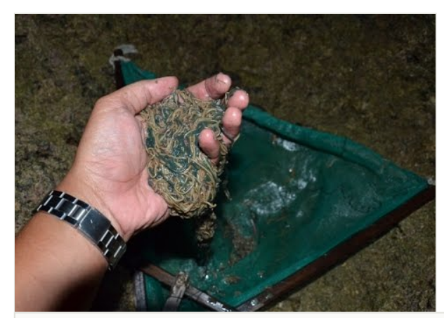
Figure 1. Timba laor (video). The video shows how natives of Ambon catch and cook the worms.

Similar to Pacific palolo , wawo or laor are edible marine worms (Polychaeta, Annelida) that are consumed by natives of Ambon, Maluku. These animals swarm twice a year to reproduce, i.e. either in February and March (Rumphius 1705), or in March and April (Radjawane 1982). The worms swarm exclusively in Ambonese coastal waters with reefs, either in the form of epigamous epitokes (i.e. sexually mature worms with heads; adapted to swim) or schizogamous epitokes (also called 'stolon', i.e. headless sexually mature worms; adapted to swim). The swarming phenomenon, the tradition of catching wawo (called ' timba laor ' among the locals) and the recipe of the traditional dish, are reported in detail by Pamungkas 2011 (Fig. 1).