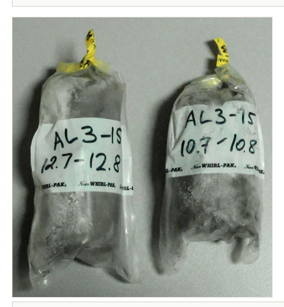
Figure 2. doi Core samples in sterile bags.