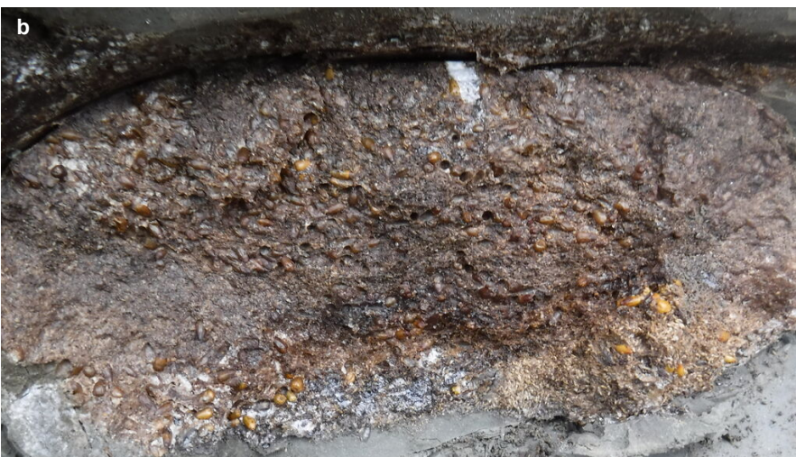
Figure 3. Late Pleistocene fossil objects on yedoma outcrops sampled for viable protist strains. a: Buried Late Pleistocene soil (paleosol) at the Duvannyy Yar outcrop (Sakha Rep.). b: Buried terminal nesting chamber of a ground squirrel burrow. Note the supply of seeds. Duvannyy Yar. doi

Buried terminal nesting chambers of ground squirrel ( Urocitellus sp.) burrows (Fig. 3b) are unique paleontological objects of Pleistocene Ice Complex sediments. They usually contain animal supplies made of seeds of surrounding grasses. Usually frozen in the living state, they are very well preserved. From the tissue of a Silene sp. seed found in a buried nesting chamber, a viable flowering plant was grown (Yashina et al. 2012). Nesting chambers also contain a diverse community of protists and fungi. Chambers were cut from the outcrop