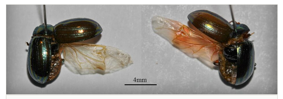
Figure 3. doi

Two specimens of Chrysolina americana showing a wing. Photographs were taken with the same zoom. The camera was a Canon EOS 600D with a Canon EF 100 mm f/2.8L Macro IS USM lens. Scale bar of 4 mm is shown.