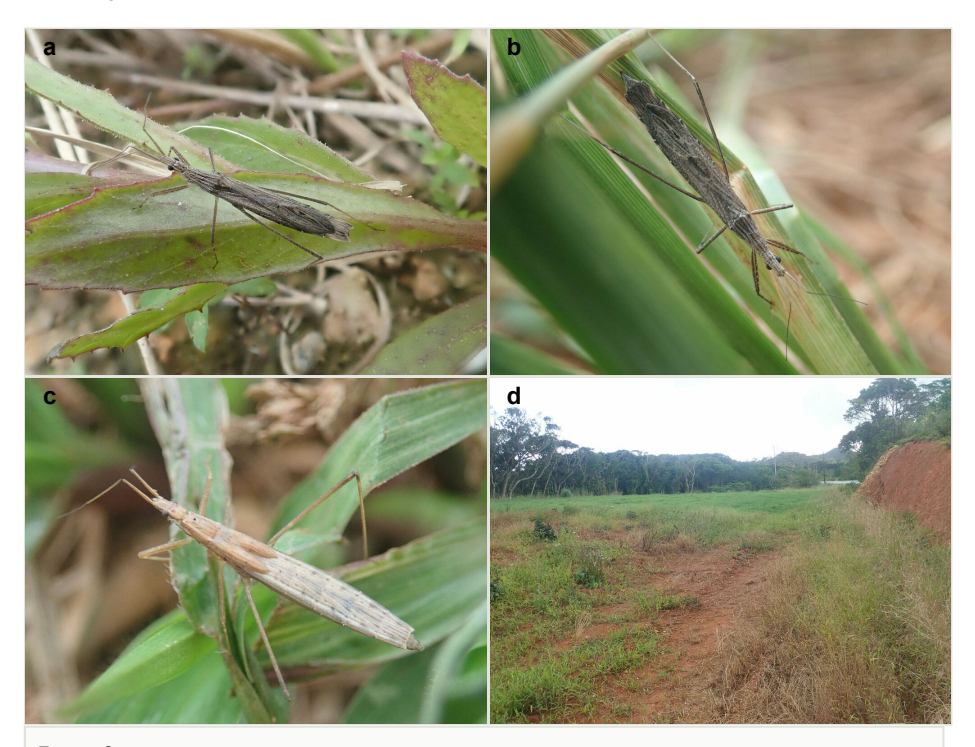
Figure 3. Pygolampis striata Miller, 1940 from Amami-ôshima Is., The Ryukyus.

collecting method" might reveal the current distribution of Stenopodainae members, including P. striata in Asia.