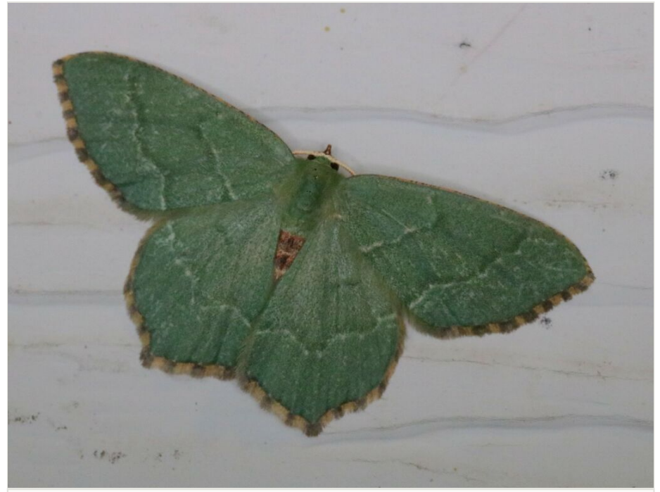
Figure 1. doi Hemithea aestivaria photographed in Saint-Augustin-de-Desmaures, Québec, on 30 June 2020.