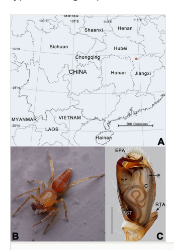
Figure 1. doi

According to Mikhailov (1995a), Mikhailov (1995b), Ono (1986), Ono (2010), the zilla -group can be easily recognised by its tiny body (with body length 1.8–3.6 mm), in association with the characteristic genital organs. The male palp has a developed and occasionally branched embolic apophysis. The female epigyne has a pair of guide pockets (or hoods) or a transverse hood near the copulatory openings. The zilla -group is a relatively small taxon, with only three species having been clearly documented: C. zilla widespread in Japan, C. minima (Ono, 2010) endemic to Honshu in Japan, C. tanikawai Ono, 1989 from Ryukyu Is. in Japan and Hunan and Taiwan in China. C. hooda Dong & Zhang, 2016 was assigned to the trivialis -group in the original publication (Dong and Zhang 2016), although it exhibits typical zilla -group features.