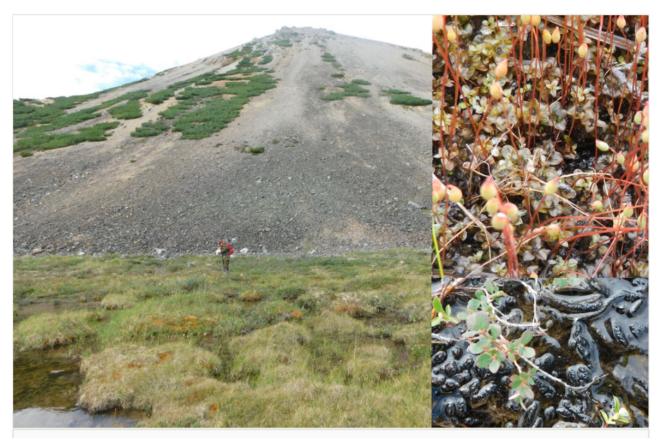
Figure 7. doi

Habitats: Larix cajanderi forests; alder and Pinus pumila thickets (Fig. 7); various tundra communities in alpine belt and on aufeis glades; mires; lake shores; willow stands in flood valleys; disturbed habitats; places of reindeer and horse grazing; steppe communities; wet marble cliffs, various rock outcrops, rock-fields and dry cliffs. Sphagnum bogs are rare (Fig. 8).