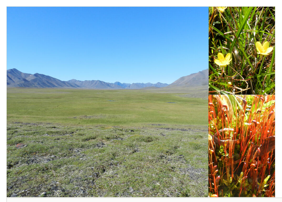
Figure 9. doi

Collection localities: Verkhoyansk, Batagai, Boronuk, Borulakh, Arylakh, and Ulakhan-Kuel vicinities; Tykakh River Basin; Kikhilyakh Ridge; Mat'-Gora (Ynnakh) mountain.