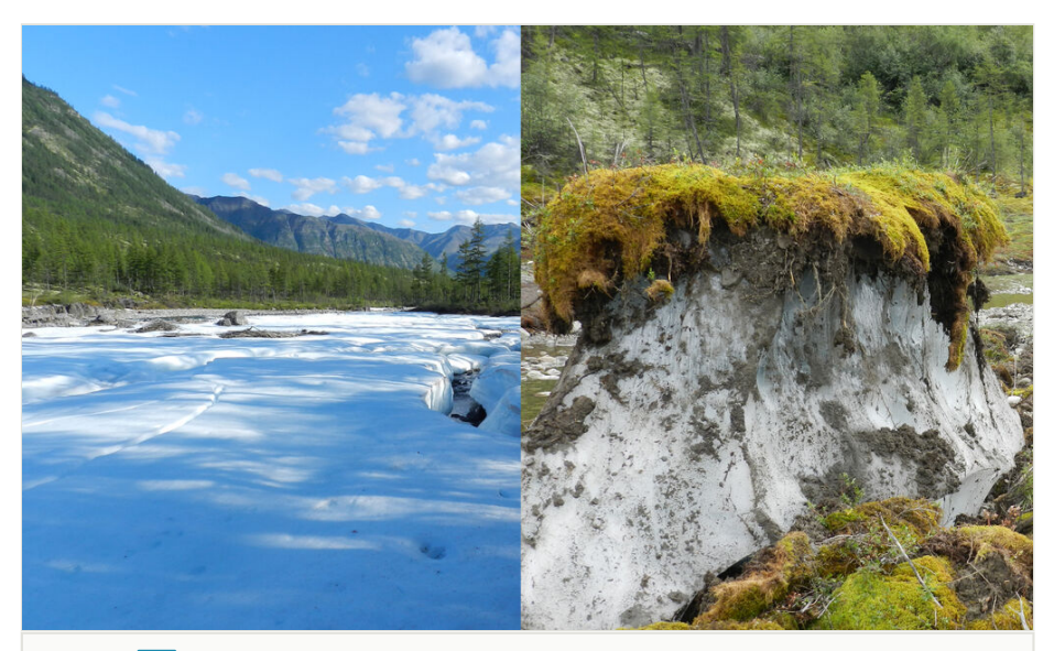
Figure 5. doi

Aufeis glades are common along creeks, lasting to July (left) and leaving only 1(-2) months for moss growth in August (right). Locality 4, ca. 600 m a.s.l. Dry rocks are rich in rare xerophytic moss species, for example, Indusiella thianschanica Broth. & Müll. Hal., Didymodon johansenii (R.S. Williams) H.A. Crum, Grimmia tergestina Tomm. ex Bruch & Schimp., Pterygoneurum ovatum (Hedw.) Dixon and Didymodon vinealis (Brid.) R.H. Zander