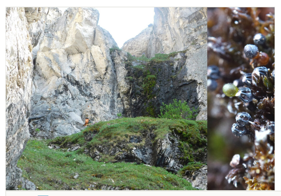
Figure 6. doi

Collection localities: Valley of Tirekhtyakh River; Mramornaya Mt. (Fig. 6); Valley of Pravyj Dzhapkychan Creek and surroundings of Kytyp-Kyuel Lake.