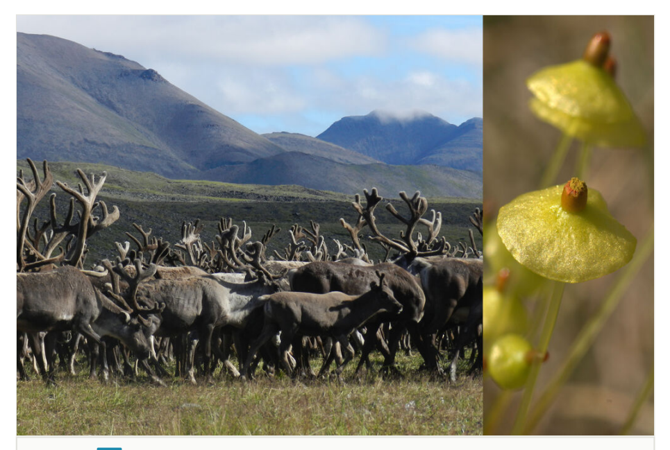
Figure 10. doi

and easternmost flanks are formed by pure calcareous ridges. In the west, the Setter-Daban Range faces the Lena River Valley and its main right side tributary, the Aldan River. In the east, the calcareous area, the Mramornaya (Marble) Mountain is a part of the Ulakhan-Chistai Range. Interestingly, these two calcareous regions are the only areas in Eurasia where the 'living fossil', the relic monospecific genus, family, order, class and division, Andreaeobryum macrosporum Steere & B.M. Murray (Murray 1988, Goffinet et al. 2009), has been discovered. This moss was first collected only in 1974, in Alaska and then described by Steere and Murray 1976 and later found in a few other localities in Alaska, USA and adjacent parts of Canada, in the Yukon, the westernmost Northwest Territories and northern British Columbia (Eckel 2007). In 2015, it was collected in Yakutia, ca. 3000 km from its closest localities in North America (Ignatov et al. 2016) and subsequent intentional search elucidated its distribution in Eurasia (Ignatov et al. 2018).