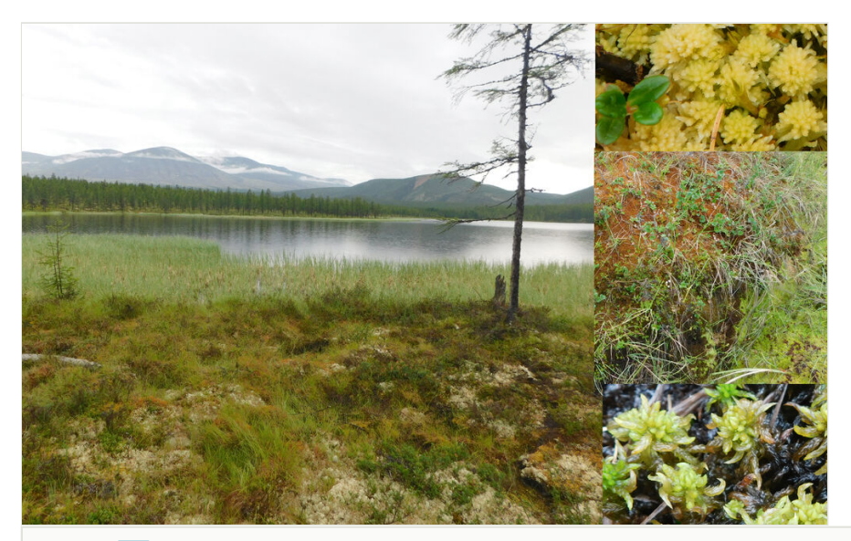
Figure 8. doi

Habitats: Larix cajanderi forests; tundra communities; rock-fields and rock outcrops; steppe slopes; flat sedge mires with shallow water from melting permafrost (Fig. 9) and reindeer pastures (Fig. 10).