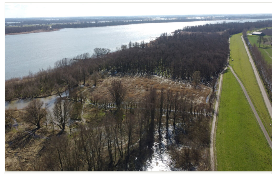
Figure 1. doi Netherlands, Dordrecht, Kop van 't Land, observation site of moths listed in dataset 06.

Quality control: Voucher specimens were taken from two subsets of data (Table 1, partial datasets 01 and 02) and obtained by sampling with a modified Robinson moth trap. These specimens are kept in the Rotterdam Museum of Natural History. Observations in partial datasets 03 t/m 17 (Table 1) were made by experienced entomologists, mutually verifying each other's observations. Partial dataset 18 contains data monitored by a team of senior urban ecologists, including experienced entomologists.