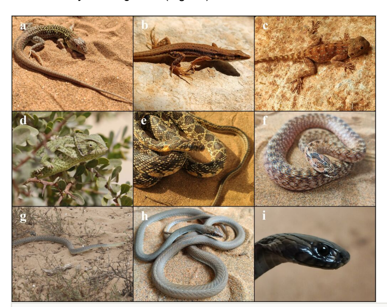
Figure 5. doi

Species of Squamates present in Souss-Massa National Park. a Acanthodactylus margaritae, photo by A. Elbahi; b Mesalina olivieri, photo by A. Elbahi; c Agama impalearis, photo by A. Elbahi; d Chamaeleo chamaeleon, photo by W. Oubrou; e Hemorrhois hippocrepis, photo by A. Elbahi; f Macroprotodon brevis, photo by A. Elbahi; g Malpolon monspessulanus, photo by W. Oubrou; h Psammophis schokari, photo by A. Elbahi; i Naja haje, photo by A. Elbahi.