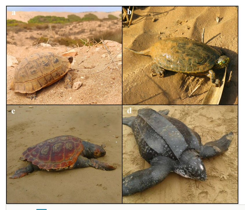
Figure 3. doi Species of Chelonians present in Souss-Massa National Park. a Testudo graeca; b Mauremys leprosa; c Caretta caretta; d Dermochelys coriacea.

Comment : It is the only species of tortoise in Morocco and is represented by three subspecies (Fritz et al. 2009): T. g. soussensis , T. g. marokkensis (both are endemic to the country) and T. g. graeca , which is distributed between eastern Morocco, northern Algeria and southern Spain. This terrestrial tortoise is represented in SMNP by the T. g. soussensis subspecies that was found at 26 sites (which represents 86.66% of all surveyed sites) with the widest distribution compared to all reptile species in the study area. Sexual dimorphism has been observed amongst this species. Generally, females grow larger than males and are characterised by a flat plastron, while males have a concave plastron.