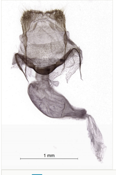
Figure 6. doi Pljushtchia argoi sp. n., female genitalia, paratype.

than in P. prima . The longer cornuti set is 0.5 mm long and reaching the short, subapical set of cornuti in P. argoi , but shorter and not reaching the subapical cornuti in P. prima (cf. Viidalepp and Kostjuk 2005: fig. 3).