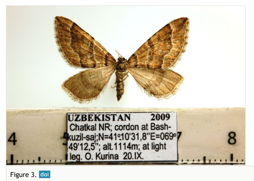
Pljushtchia argoi sp. n., female paratype.