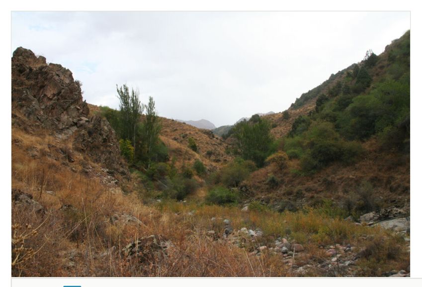
Figure 1. doi Sampling site landscape in Chatkal NR.

The genus Pljushtchia was described for P. prima from the southern slope of Hissar Mts. in Tajikistan (Viidalepp and Kostjuk 2005). The autumnal moths from a remote area are poorly discussed in scientific literature (Parsons et al. 1999, Viidalepp 2011). The purpose of the current review is to describe a new species of the larentiine genus Pljushtchia Viidalepp & Kostjuk found in Uzbekistan.