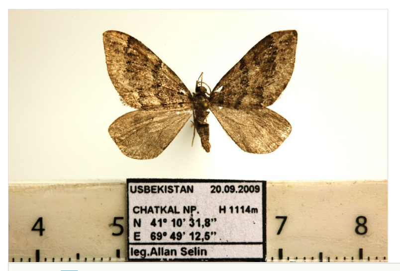
Figure 2. doi Pljushtchia argoi sp. n. male paratype.

emarginated ventro-distally, its ventral edge with triangular projection. Labides nearly filiform. Aedeagus 1.0 mm long, the longer cornuti bundle being 0.5 mm long and reaching the base of the subapical bundle of short cornuti. Female genitalia (Fig. 6) with antrum wide, ductus bursae short, corpus bursae plain, without signum and provided with a membranous appendix. The last abdominal segment broad, apophyses posteriores as long as apophyses anteriores.