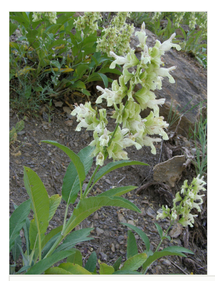
Figure 1. doi A plant of Salvia korolkowii at Xumson, Uzbekistan.