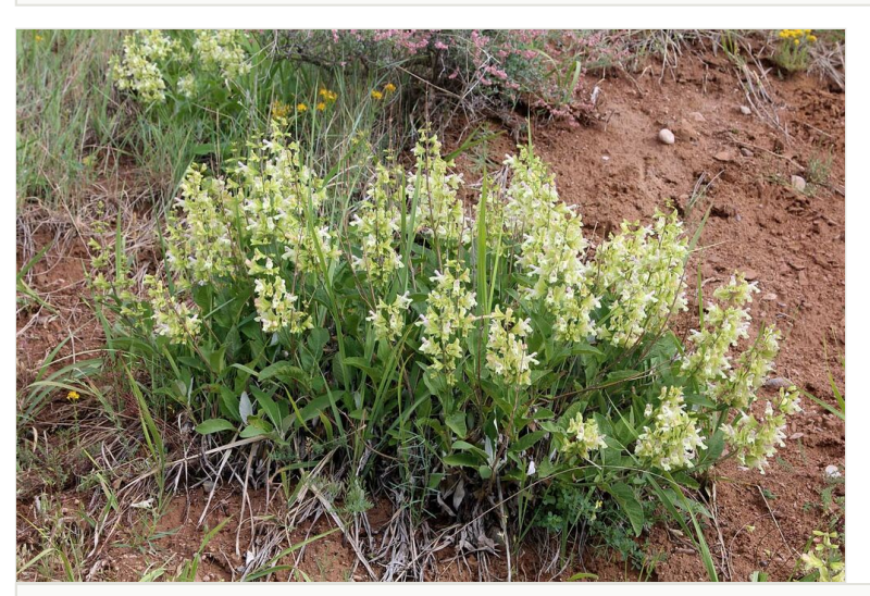
Figure 2. doi A large cushion of Salvia korolkowii along the Beldorsoy River, Uzbekistan. Photographed by A. Gaziev, 8 June 2014. Source: <a href="https://www.plantarium.ru/page/image/id/246310.html">https://www.plantarium.ru/page/image/id/246310.html</a>.