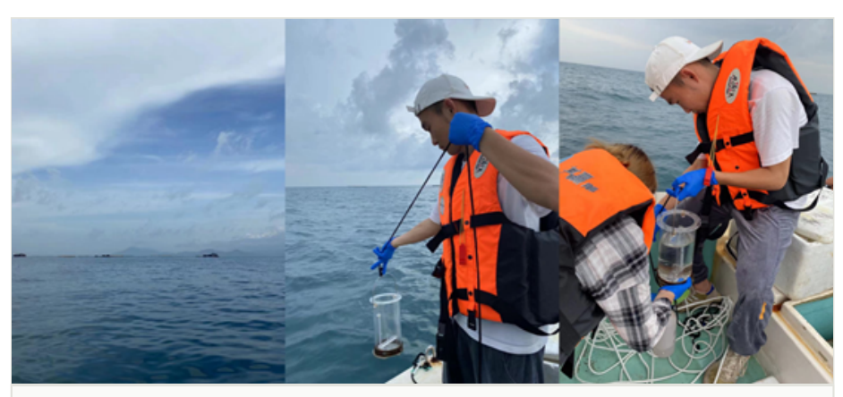
Figure 2. doi Photos of the habitat of sea area surrounding West Island and fieldwork.

Step description: The eDNA was extracted using the DNeasy Blood and Tissue Kit (QIAGEN, Germany) and the following modifications were made compared to the spin column protocol: a) add 720 \mu I ATL Buffer and 80 \mu I Proteinase K into centrifuge tubes containing filtration membranes and incubated 3-4 hours at 56°C; b) add 800 \mu I AL Buffer and 800 \mu I 96% ethanol after incubation; c) elution was done in 2 × 50 \mu I TE Buffer for a final volume of 100 \mu I. For each round of extraction, an extraction blank sample was made for monitoring cross-contamination, with smaller volumes being added: 180 \mu I ATL Buffer, 20 \mu I Proteinase K, 200 \mu I AL Buffer and 200 \mu I 96% ethanol. The laboratory tables, aseptic operation tables and experimental equipment were regularly cleaned with 5% bleach and then 75% ethanol before DNA extraction. The extracted DNA samples were stored at -20°C.