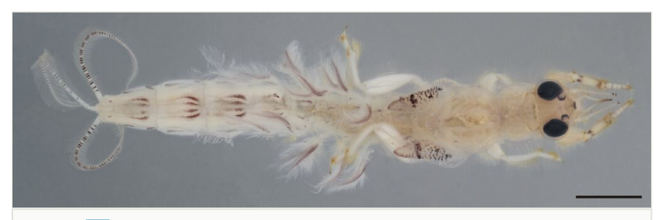
Figure 2. doi Habitus of Ephemera glaucops . Scale: 2 mm.

glaucops is also distinguishable from E. vulgata by smaller size (the last-instar larvae 13.5–14.5 mm long in E. glaucops , compared to 20–21 mm in E. vulgata ). In our specimens of E. glaucops , we also noted a characteristic shape of clypeus, with strongly divergent lateral margins (Fig. 3a). This character was not used in recent identification keys and might be a subject of variability.