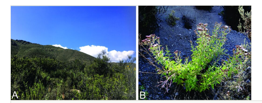
Figure 3. doi Habitat and host plant of Oidaematophorus andresi sp. n. A Habitat at the type locality, near Socoroma Village in the Andes of northern Chile; B Stevia philippiana at the type locality.