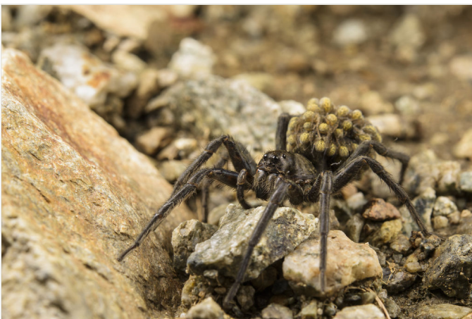
Figure 2. Vesubia jugorum — female with spiderlings.