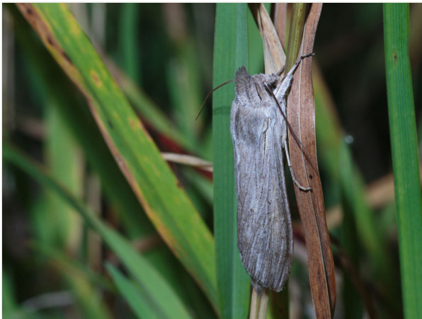
Figure 2. doi

b: female collected at Aza-usotan, Hamatonbetsu-chō, Esashi-gun, Hokkaidō, Japan.